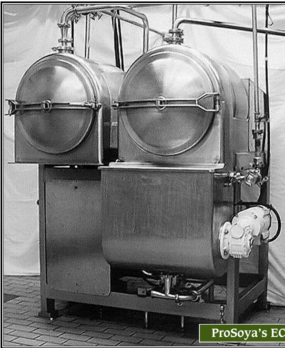
ProSoya's EC 2000

EC 1000 and EC 2000 are efficient and economical extraction systems. They can improve the soymilk yield by up to 25%. While EC 1000 can extract up to 1000 L/h of soymilk base, EC 2000 has twice the capacity. Both models extract soymilk and wash okara simultaneously. This rewash process yields a weak soymilk, which is recycled back to the grinder (feed hopper). This upgrade can be used in combination with the Okara Conveying System and Clean-In-Place (CIP) options. Spare Cones are also available.