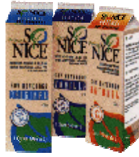
SoNice beverages in refrigerated gable-top format

It should be made clear that soyfoods and beverages made by any process do not taste like dairy based foods and beverages to most consumers. Nevertheless, soyfoods and beverages made using the airless cold-grind process do have their own good cereal taste. SoNice formulations developed for the process are liked by most people including those of European, Asian, and African descents. For this reason, SoNice customers include a large number of mainstream consumers. As a result, the total market of beverages has greatly expanded and is continuing to expand at a rapid rate.