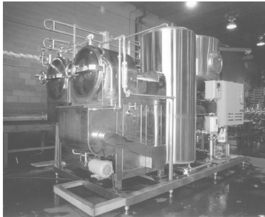
Basic VS2000 system less the flash tank for deodorization

VS2000 produces 2000 L/H of soymilk base or up to 5000 L/H of soy beverages ( Picture 3 ). It is a continuous system right from the grinding of soybeans to the point of storage of soymilk in the bulk tank or for its further processing. A VS2000 system used solely for making powdered products may be assembled without the vacuum flash tank to minimize the plant cost, for extensive deodorization takes place in the evaporator and dryer. The system is mounted on one or more skids depending upon the options desired. 10 such systems have been built for customers in Russia and Canada. The system price starts at US$250,000 (for the unautomated system without vacuum flashing operation).