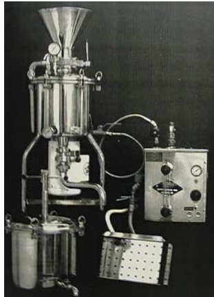
VS40 System shown complete with electric boiler, filter press and tofu box

produce 30 to 40 L/h of soymilk base or up to 80 L/h of soy beverages or 10 to 12 kg/h of tofu. Several hundred such systems are currently in operation throughout the world.